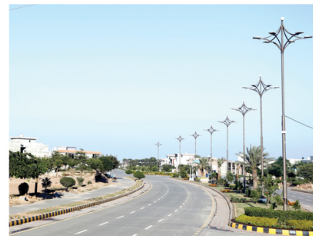
150FT WIDE MAIN BOULEVARD