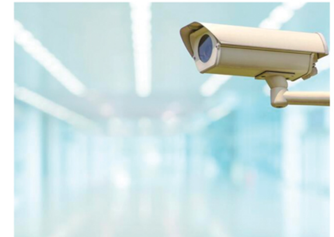
24/7 SECURITY SURVEILLANCE